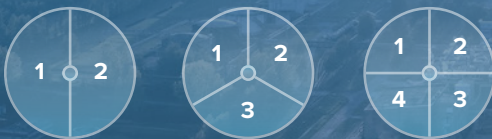
ROTARY TABLE CONFIGURATIONS