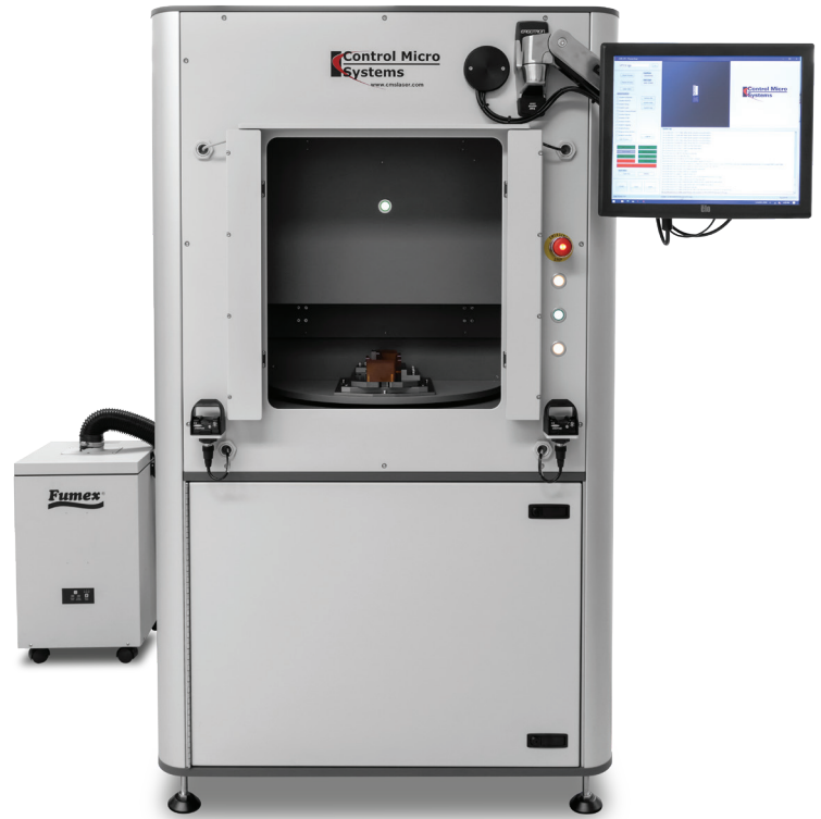
OTHER MODELS AVAILABLE