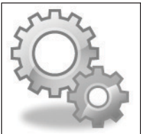
External Axis Control & I/O

Programming and connectivity is controlled through a simple USB interface to a laptop or desktop PC. Additional features such as external axis control, dedicated I/O, marking on the fly and camera assisted marking makes the Vereo™ a powerful tool for any production process.